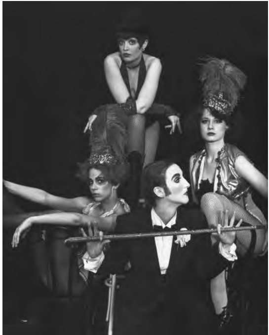
Photo from TUTS' 1976 production of Cabaret